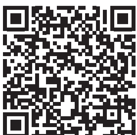
photo access is the ACT and region's centre for contemporary photography, film and video and media arts. An established non-profit incorporated association based at the Manuka Arts Centre in Canberra, we're a friendly creative community making, sharing and investigating photographic culture in the interests of artistic expression, cultural participation and positive social change. All proceeds go to continuing our program of exhibitions, workshops, artist residencies, and community projects!